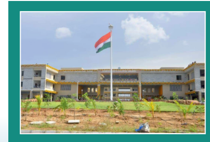
COLLECTORATE, R.R. DIST.