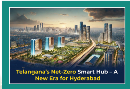
FUTURE CITY HYDERABAD